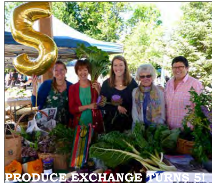
PRODUCE EXCHANGE TURNS 5!

Have you got something to sell or give away, trade or are you looking to buy something? (local, private adverts only) email.editor@theblackwoodtimes.com.au