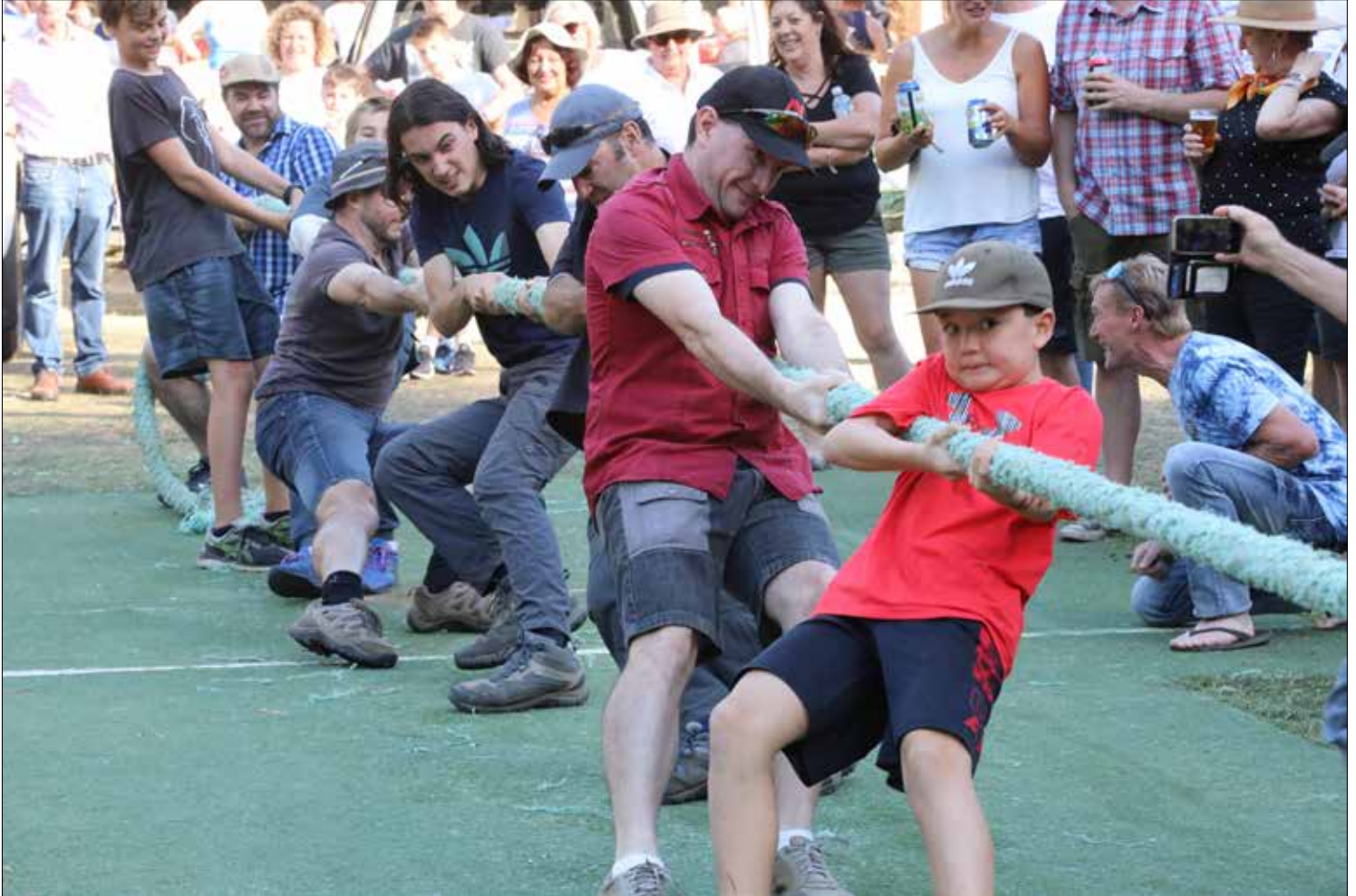
Blakeville Boys show how it's done (2019 winners)