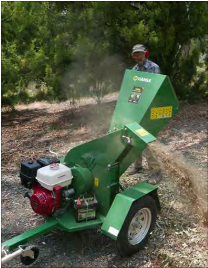
Clint O’Grady operates Landcare’s new community chipper

©2020 auspiced by Blackwood Progress Accociation Inc