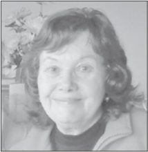
Compiled y Margot Hitchcock, Historian for the Blackwood & District Historical Society. September 2019

As can be seen at the back of the Blackwood cemetery there are on un-consecrated ground the graves of many Chinese miners, some of which have stone headstones with Chinese inscriptions on them. From my early research – many Chinese from Canton, arrived on the diggings in Blackwood in 1858.